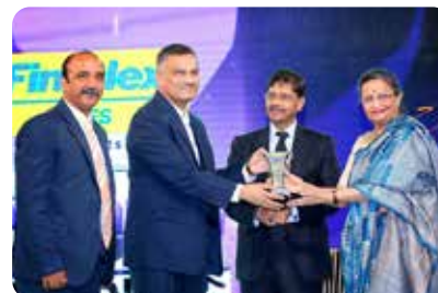
HARIDWAR GREENS-BEST TOWNSHIP PROJECT OF THE YEAR Under 200 acres at NDTV Property Awards 2017