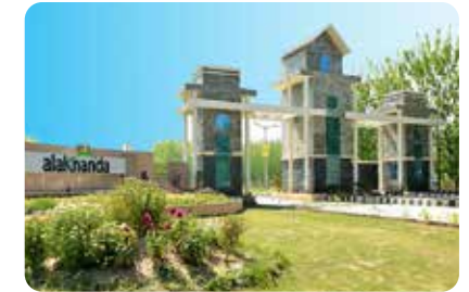
ALAKNANDA, HARIDWAR Your dream home in the land of Gods