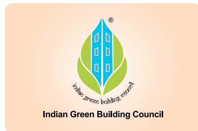
ACCOLADES IGBC Gold Certified Projects to enable sustainable environment for all.