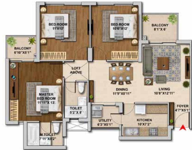
APARTMENT- 3 & 4 | TOWER- 5 & 7