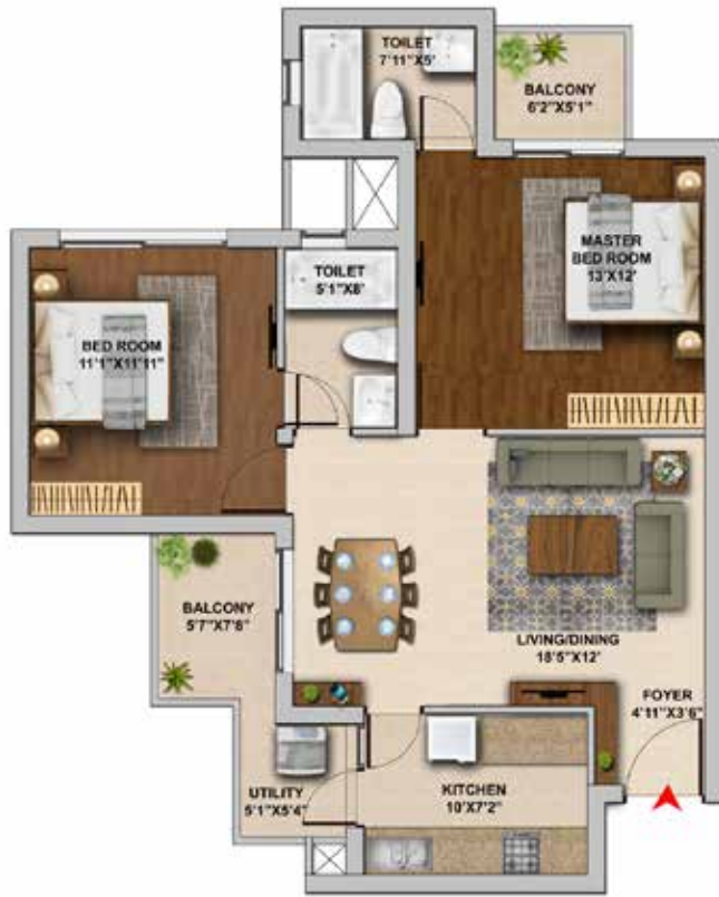
2 BHK SMART APARTMENT LAYOUT