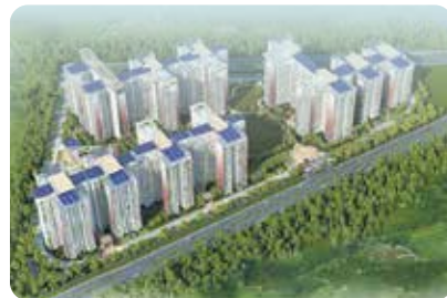
HERO HOMES, LUDHIANA Enjoy the perfect blend of luxury and serenity