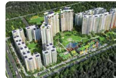
HERO HOMES, MOHALI An abode of exceptional living