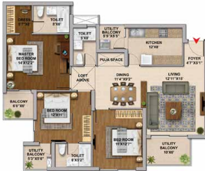
APARTMENT- 1 & 2 | TOWER- 5 & 7