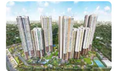
HERO HOMES, GURUGRAM World of Wellness