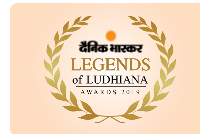
HERO HOMES, LUDHIANA-THE 'BEST ECO-FRIENDLY PROJECT 2019' AWARD. Dainik Bhaskar Award 2019