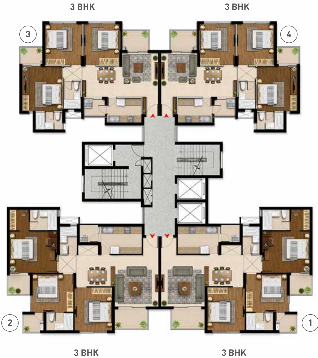
CLUSTER PLAN, TOWER - 5&7