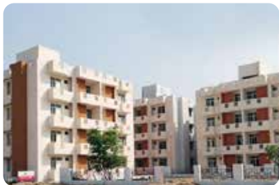
GHARAUNDA, HARIDWAR Your perfect home