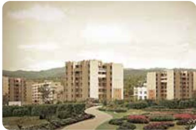
HARIDWAR GREENS Step into your new home with neighbours waiting to welcome you