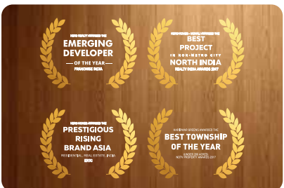
AWARDS Our prized possession awaits you