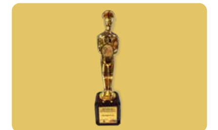
HERO HOMES GURUGRAM-BEST RESIDENTIAL PROJECT OF THE YEAR at the Prestigious EPC World Awards 2019