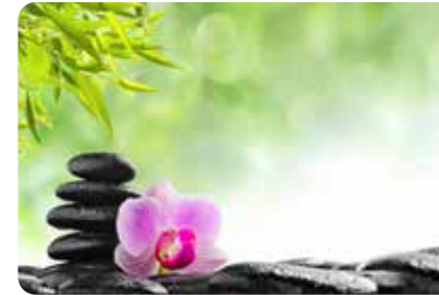
UTKARSH, HARIDWAR Premium Plots