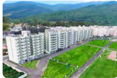
HOLIDAY HOMES, HARIDWAR Your home set amidst the lap of nature